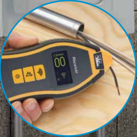
Individual wires can be sorted, opens can be located and shorts can be isolated.