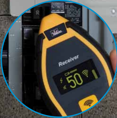
Receiver identifies the correct circuit to which the transmitter is connected.