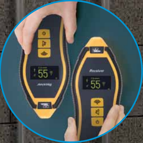
Revolutionary technology in the RC-959 rotates the display in 90° increments so that you always receive an upright reading. Even when the receiver is pointing down, you can keep up.