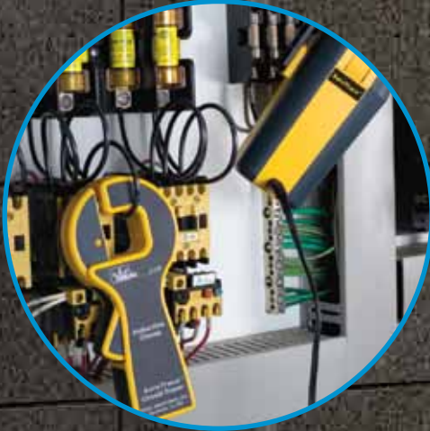
Inductive clamp allows you to induce a tracer signal on to the cable without affecting the low voltage signals on the circuit.