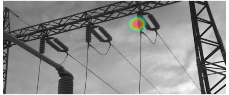
Example of Si124 PD severity assessment