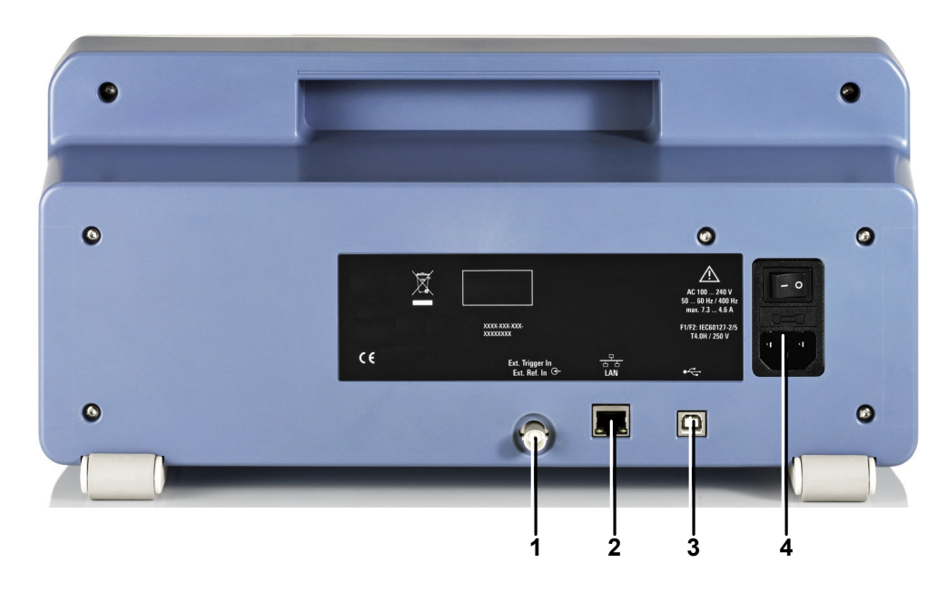
Figure 4-2: Rear panel of the R&S FPC