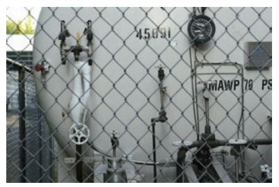
Difficult inspection sites