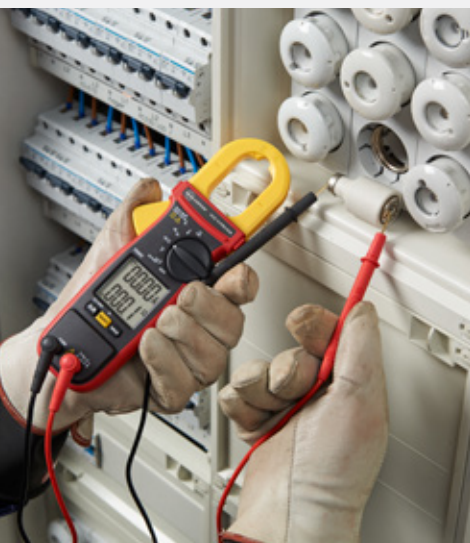
The ACD-14-PRO-EUR has a full set of functions to cover a variety of professional applications.