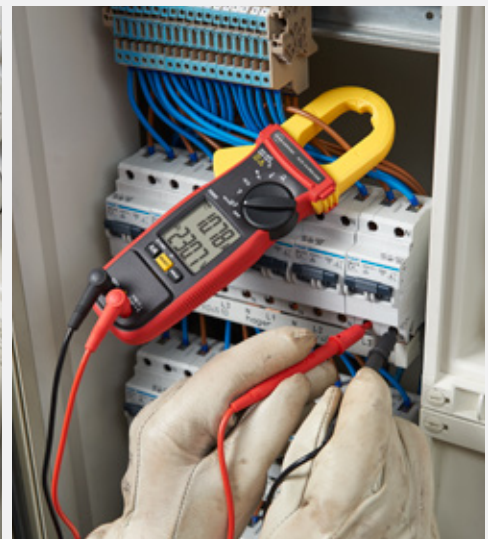
The ACD-14-PRO-EUR can test and display voltage and current measurements simultaneously with the large backlit LCD dual display, for voltage drop tests and other applications.

Voltage drop test - dual display allows user to view voltage and current simultaneously to assess voltage drop for current changing from zero to a maximum value.