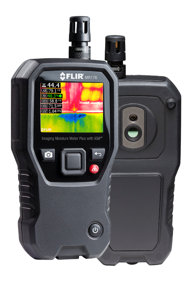
IGM technology guides you where to measure