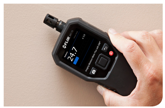
Verify moisture with Pinless measurements