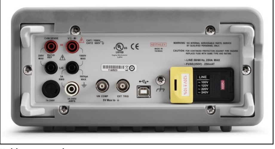
Model 2100 rear panel