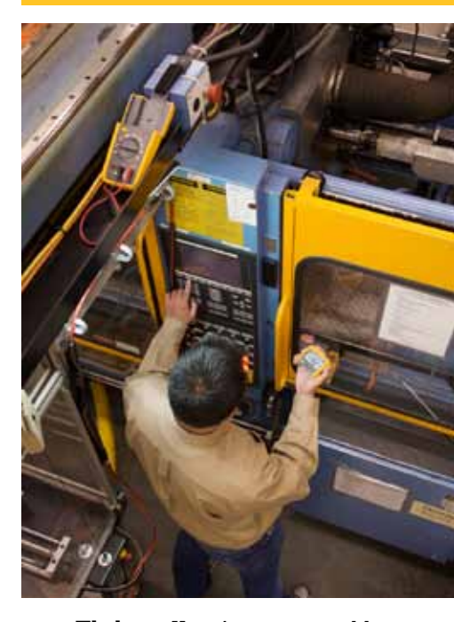
Fluke. Keeping your world up and running.®