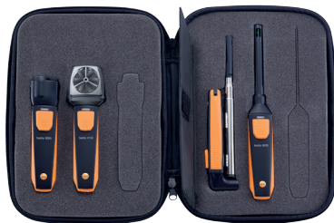
VAC Smart Probe Kit: 0563 0003