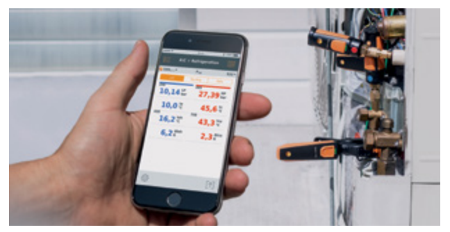
With the AC/R kit, you can measure high-side and low-side pressures and temperatures of A/C and refrigeration systems