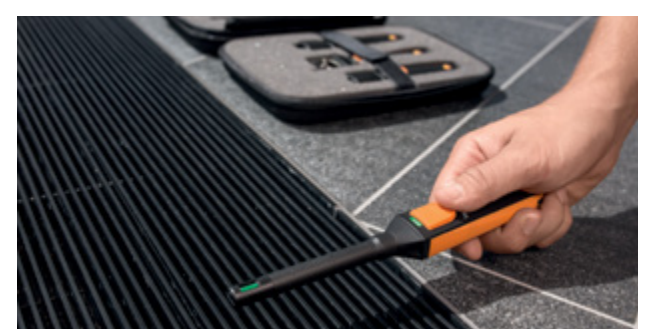
With the VAC kit, you can measure, balance, troubleshoot, and optimize the performance of ventilation systems