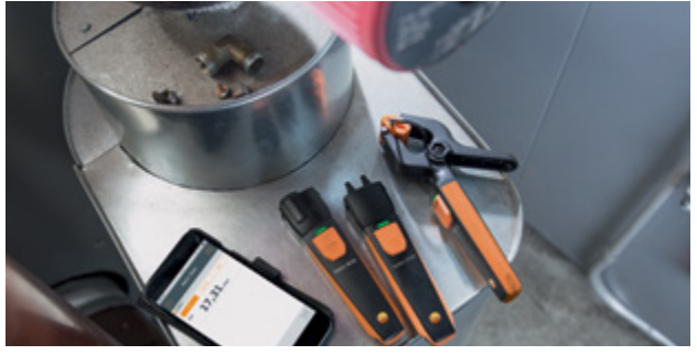
With the Heating kit, you can determine gas flow and static pressure, measure temperature of radiators, and much more